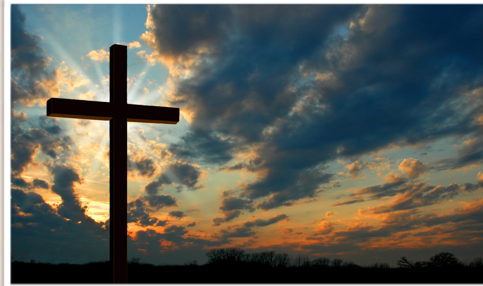
Ten Rules For Happier Living By Unknown

“God is a Spirit; and they that worship him must worship him in spirit and in truth.” John 4:24